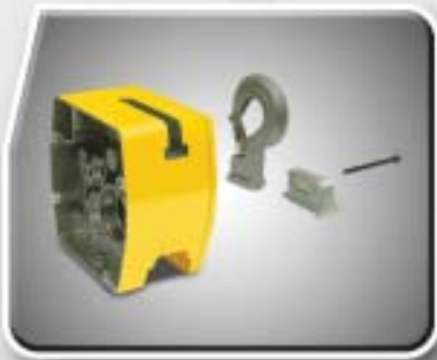
Easy Change Top Suspension